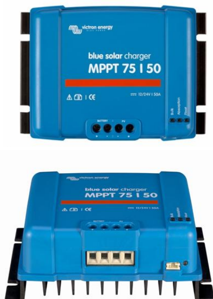
Solar charge controller MPPT 75/50